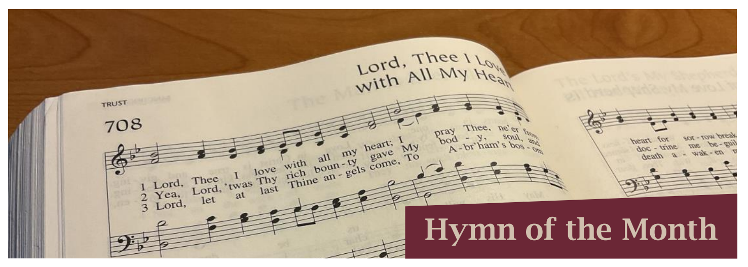
In anticipation of our congregation's 75th anniversary in November 2024, we will have a hymn chosen for each month which will be used during the Divine Service. The hymns of the church give God's people the words to sing his praises and to confess what he has done for them in the saving death and resurrection of his Son Jesus Christ.